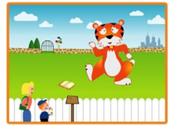
At The Zoo

My Animal Friends has been carefully crafted to be appropriate for ages 6-to-24 months with the child's interactions with the program changing as they grow through this period.